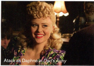
Attack as Daphne in Dad's Army

I think the director described her as spirited and delightful, but she's also quite feisty. She's a proper girl's girl but she'll kick another woman up the arse if she eyes up her bloke, Walker [played by Daniel Mays].