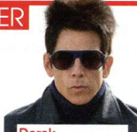
Derek Zoolander ▶