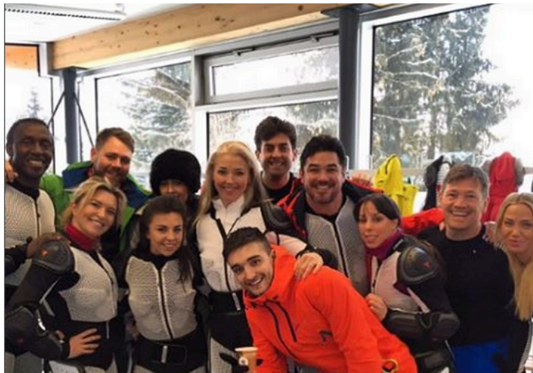
Louisa Lytton and Tom Parker had met on The Jump last year

Given that Tom is in a relationship, fans were quick to comment on Twitter.