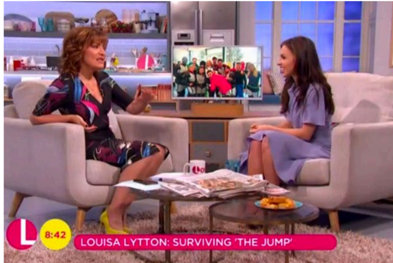
Lorraine: Lorraine Kelly confused viewers by asking about romance with Louisa Lytton and Tom Parker [ITV]

She added that she was looking forward to hitting the road with Tom when Grease goes on tour from March.