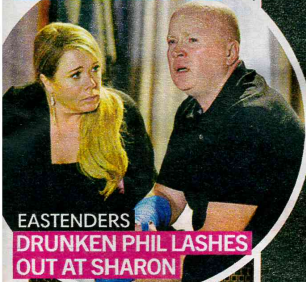
EASTENDERS DRUNKEN PHIL LASHES OUT AT SHARON