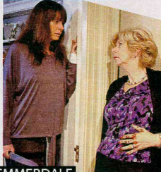
EMMERDALE CHAS KILLS DIANE?