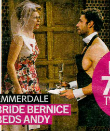
EMMERDALE BRIDE BERNICE BEDS ANDY