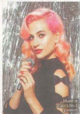
Music is Pixie's No. 1 passion

INTERVIEW: DOMINIQUE AYLING